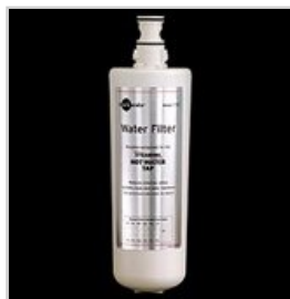
Replacement Filter - F701R (pack of 2)

Chlorine, taste and odour filter with additional lead protection and a scale reduction capability It filters sediment to a 5 micron level Replacement recommended 6 monthly